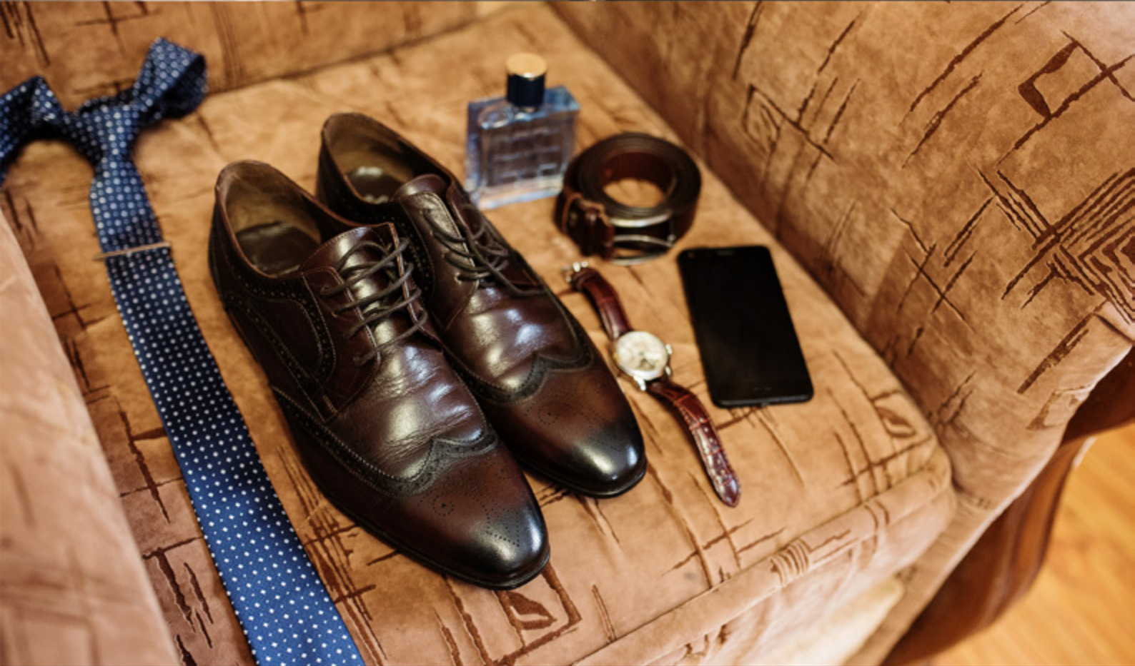
Premium Leather Shoes